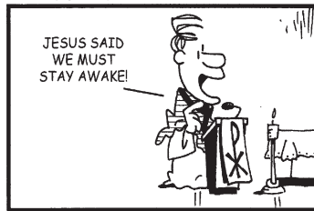
1ST SUNDAY OF ADVENT